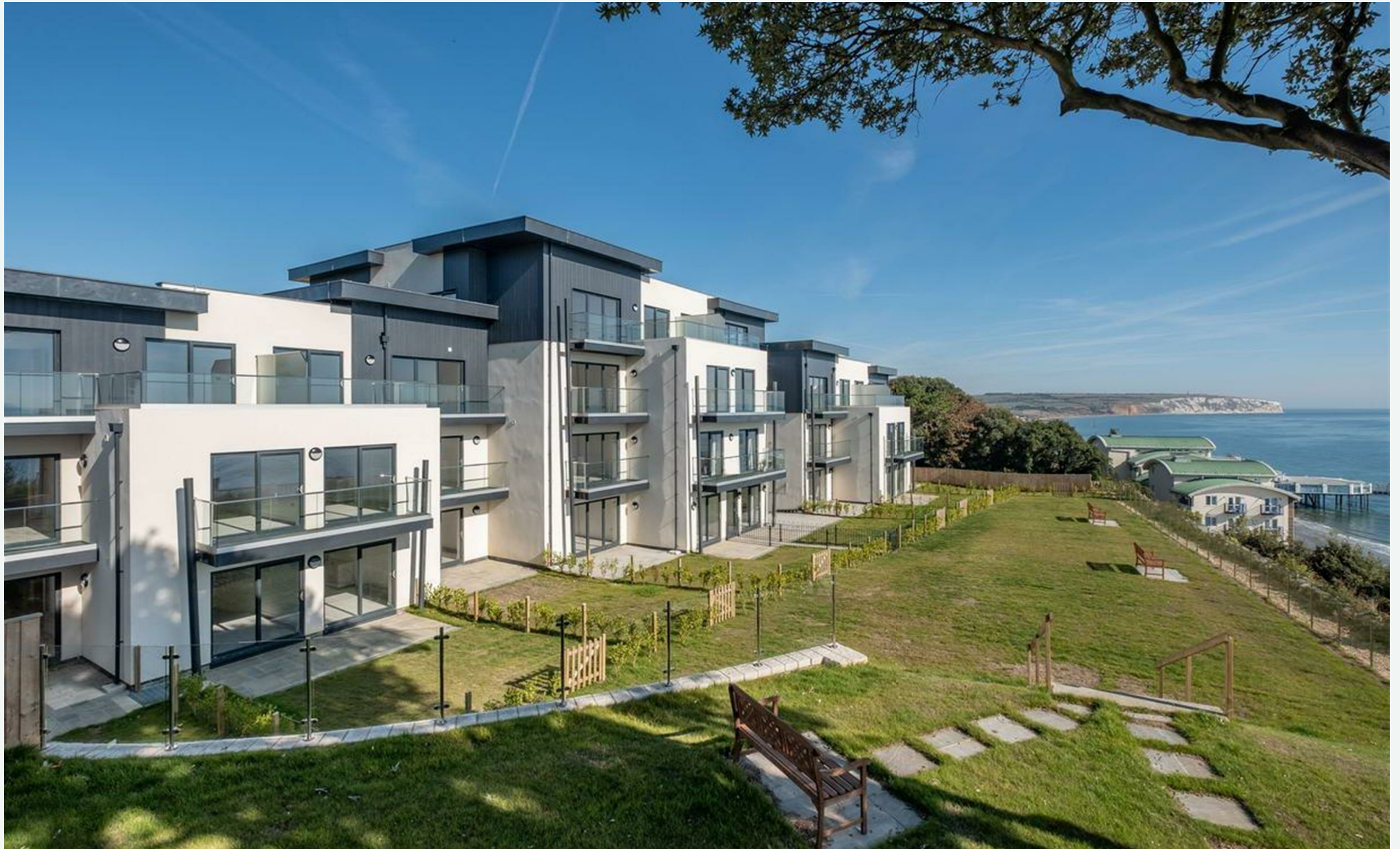
22 Royal Cliff Apartment, Second Floor, Grange Road, Sandown, Isle of Wight, PO36 8FB